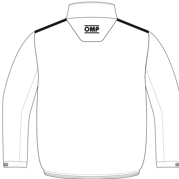
Summer jacket OR0-5939